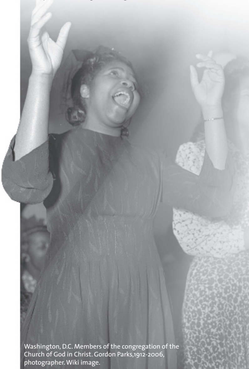
Washington, D.C. Members of the congregation of the Church of God in Christ. Gordon Parks, 1912-2006, photographer.

August himself has called Aunt Ester “the most significant persona” in the Century Cycle and when she dies in King Hedley II , many of the characters believe that all is lost. The person who carried the memory of the people is gone, taking with her what may be the true religion of August Wilson’s work — remembrance and redemption.