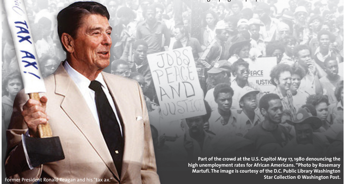
Former President Ronald Reagan and his "tax ax."

The Women's Movement of the 60s and 70s drove workplace and healthcare reforms that benefited many. However, the rise in conservatism brought about a federal government that sought to curb that progress. Reagan's alignment with evangelicals made him a vocal opponent of abortion. His administration's cuts to social programs heavily impact on women and children. On the 10th anniversary of Roe vs. Wade the president published a book entitled Abortion and the Conscience of the Nation which linked abortion to eugenics and enslavement. Though not successful in curbing abortion rights on a national level, the President's insistence that abortion "killed more than 15 million unborn children" fueled public opinion leading to abortion restrictions on Native reservations and changed doctors' disclosure rules for underaged pregnant people.