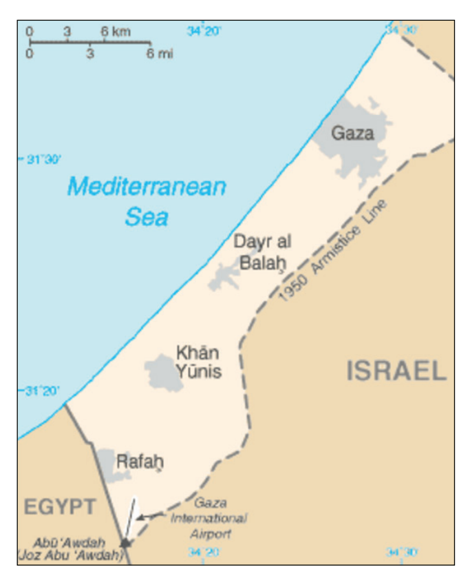
The Gaza Strip

Members of Oregon Shakespeare Festival Education and Engagement created the 2022 Study Guide for unseen . These suggestions were designed for students and teachers but may be enjoyed by audiences of all ages. They may be used without restriction for educational purposes. The Oregon Shakespeare Festival is not responsible for the content of any website listed above.