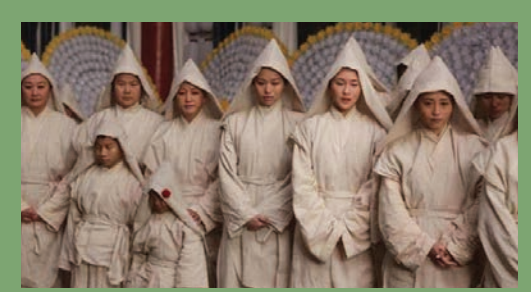
Traditional Chinese funeral clothing