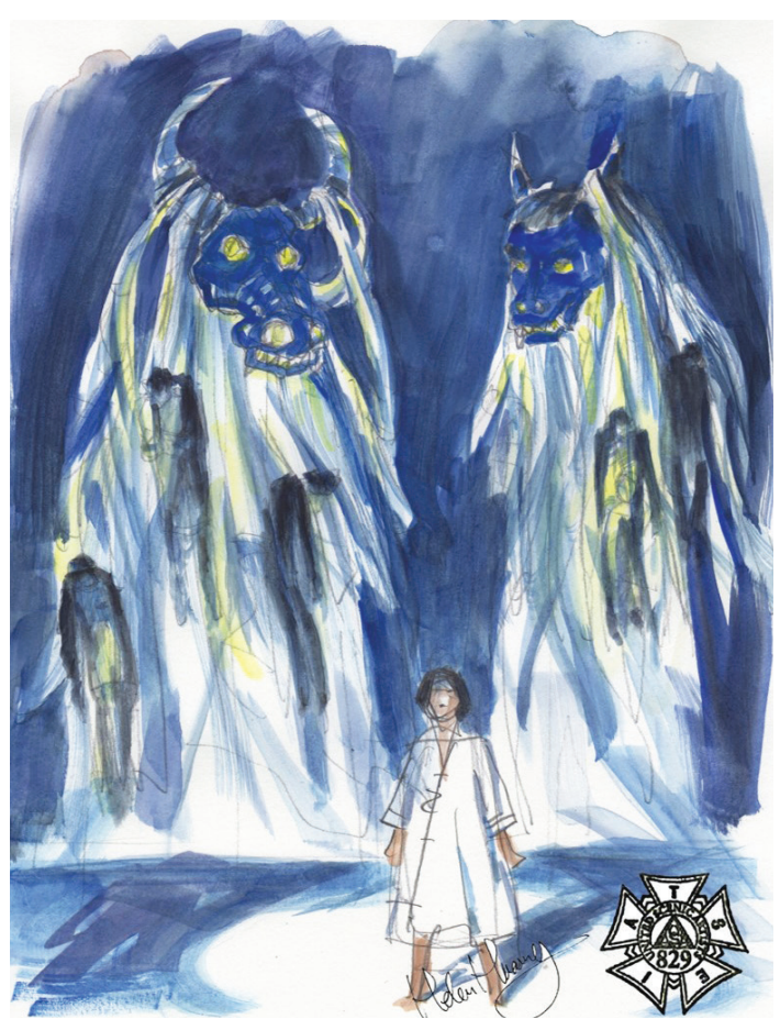
Ox-Head and Horse-Face costume rendering by Helen Q. Huang.

https://ferrebeekeeper.wordpress.com/2012/09/05/horse-face-ox-head/