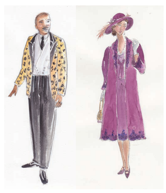
Duke and Luciana costume renderings designed by Kara Harmon.

http://memory.loc.gov/ammem/fedtp/ftsmthoo.html http://globalshakespeares.mit.edu/asia/# http://ybglobal.org/media-press