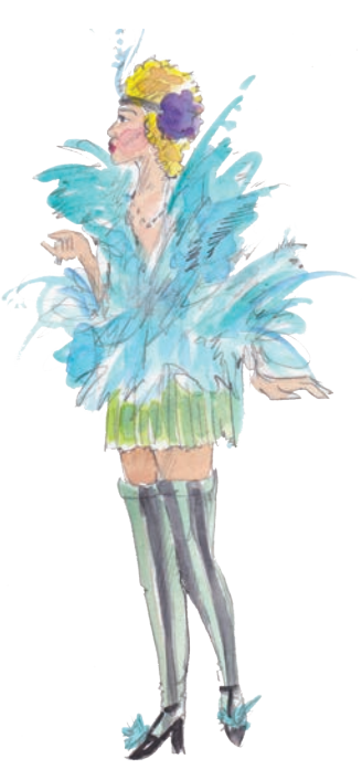
Courtesan costume rendering designed by Kara Harmon.

13. What contrasting points of view do Adriana and Luciana express about marriage and duty? What are Luciana's views on marriage? To what extent are they influenced by her lack of experience? What are Adriana's views on marriage? To what