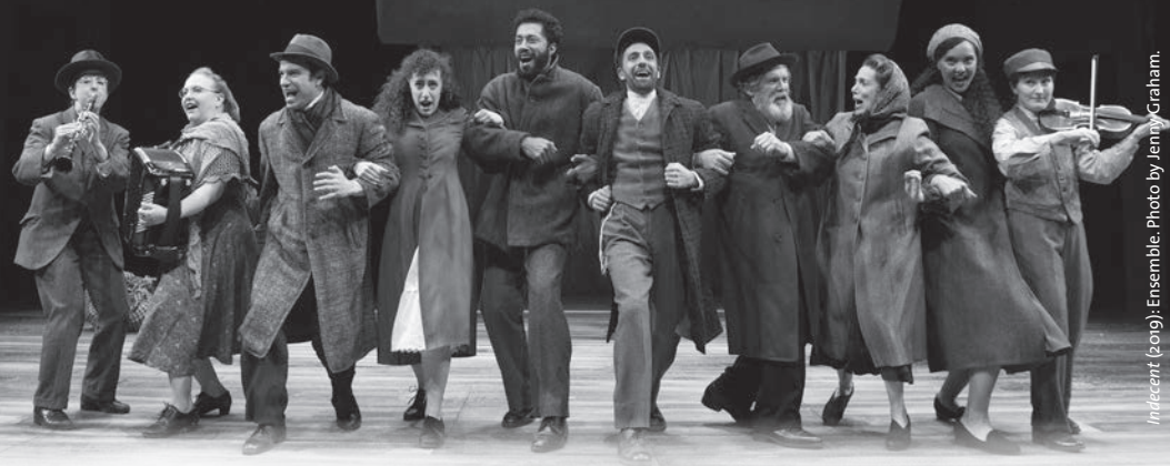
Indecent (©09), Ensemble.

WHOSE SUPPORT MAKES THIS SEASON POSSIBLE.