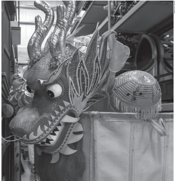
Audience Development is committed to building an audience that reflects our nation's diversity in its many expressions. Part of that effort involves participating in multicultural events around the Rogue Valley. The dragon from Snow in Midsummer (2018) could be seen parading through Jacksonville during the 2020 Chinese New Year celebration.