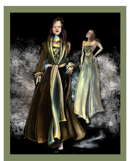
2019 costume rendering for Lady Macbeth by Chrisi Karvonides-Dushenko.

http://www.deadblack.net/samhain/laws.html http://www.carmentablog.com/2016/02/23/xenia-laws-ofhospitality-in-different-cultures/