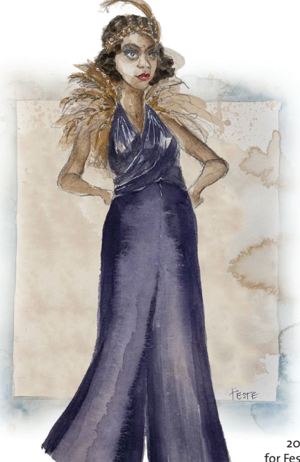
2023 costume design for Feste in Twelfth Night by Melissia Torchia.