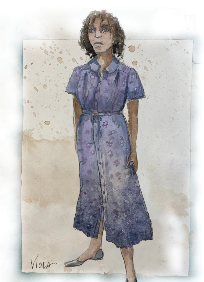
2023 costume designs for Viola in Twelfth Night by Melissa Torchia.